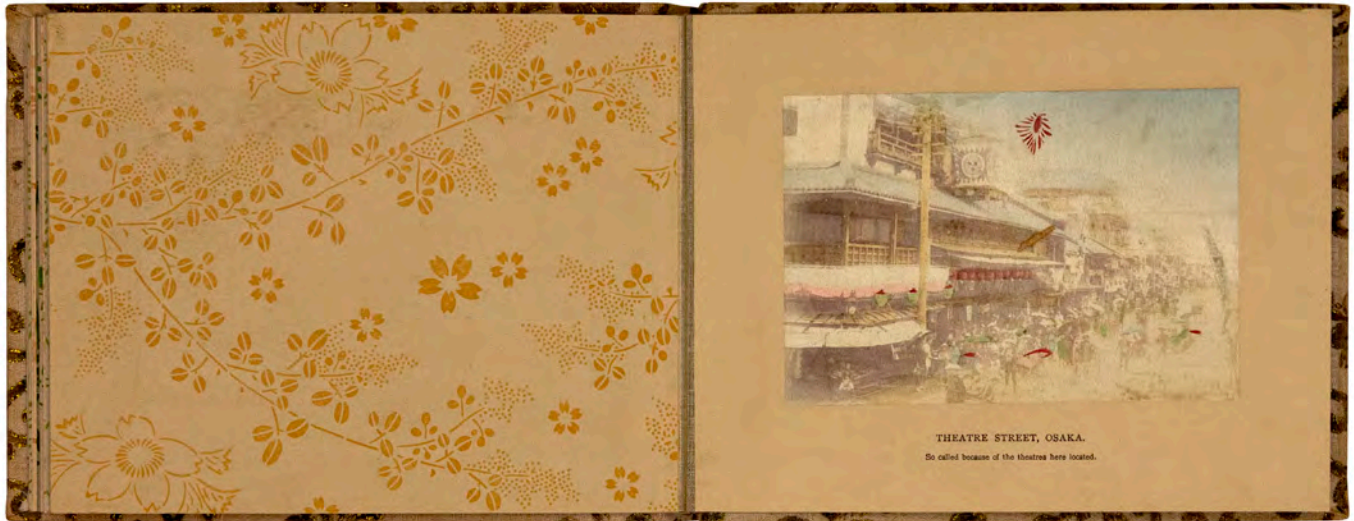
THEATRE STREET, OSAKA. So called because of the theatre here located.