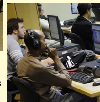
Integrate library resources into classroom instruction