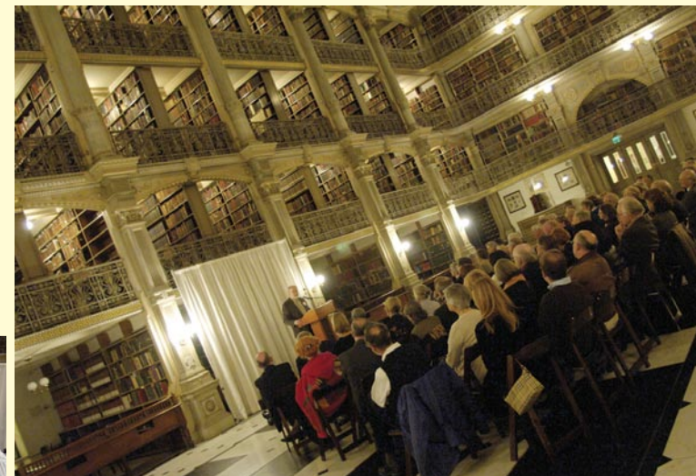
Develop innovative new services and digital initiatives