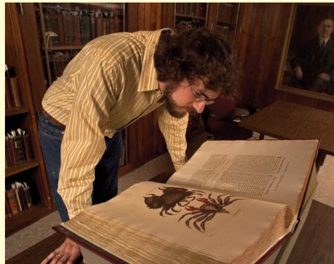
Acquire books, journals and multimedia