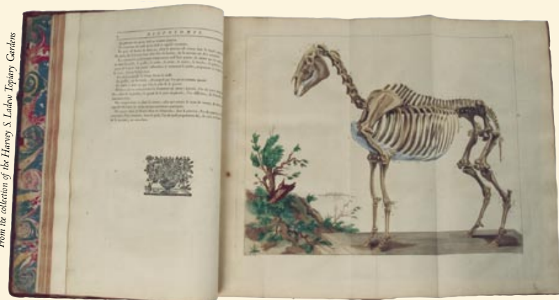
From the collection of the Harvey S. Ladew Topiary Gardens